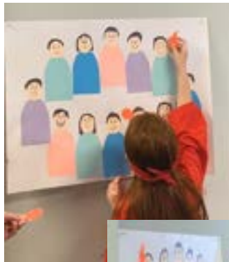
A game of Pin the Flame on the Apostle was enjoyed.